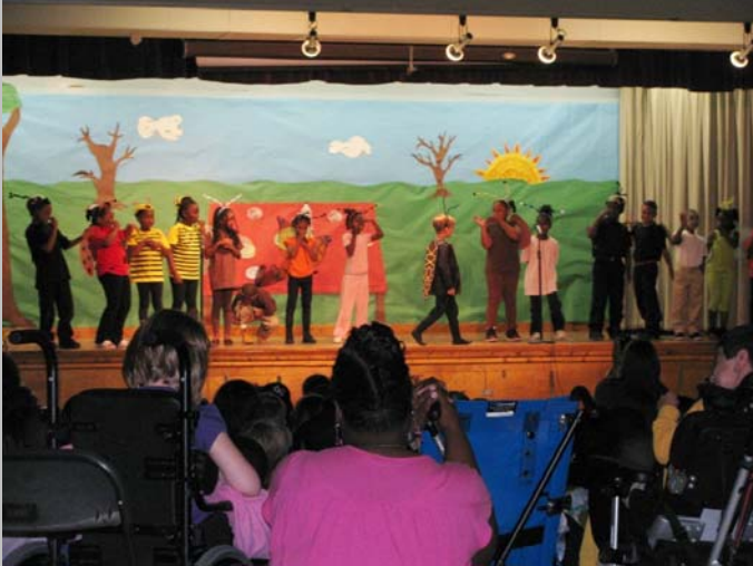
Elementary school musical production