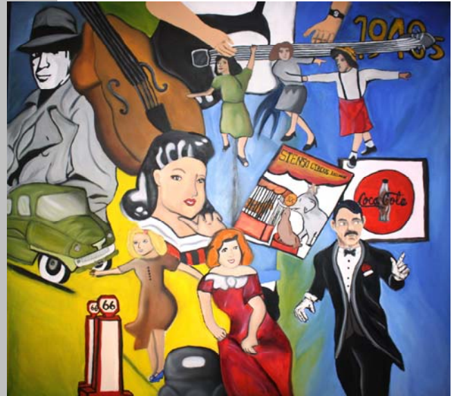
Student iconic rendering of life in the 1940's

Engaging the whole brain, educating the whole child; Arts Education is the spark which ignites a student's curiosity and imagination, fostering meaningful connections to other subjects. By studying the Arts, students discover purpose, ownership and joy in learning. When you create it, you own it!